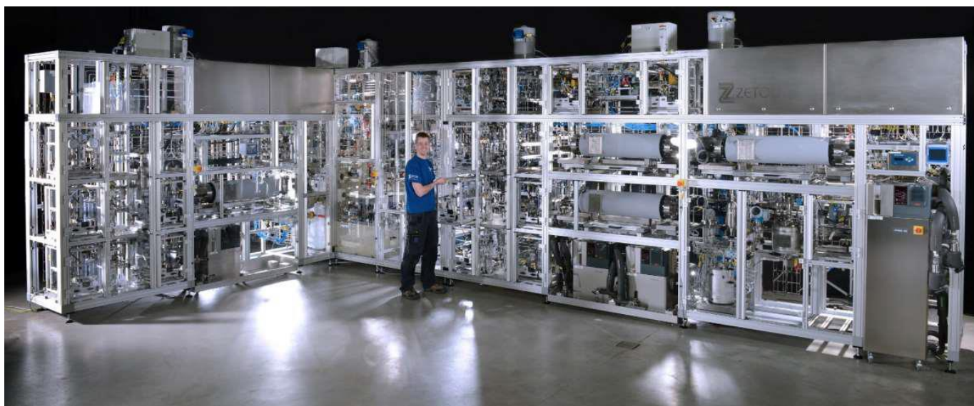
Figure 1. Example of a modular, multi-stage continuous flow plant [1-4].

Abstract: Industry wide there is a drive for resource efficiency and flexibility, to adapt quickly in what is increasingly becoming a volatile, changing marketplace. As the ‘patent cliff’ looms for many high-volume API’s, there is also a shift away from blockbusters towards lower volume, higher potency API’s. This presents an opportunity to adopt newer methods of production that are more suited to the needs of flexible, lower volume, increased potency products, such as continuous manufacturing. Whilst an increasing number of continuous processes are being developed, one question continues to come up ‘how do regulators feel about continuous manufacturing?’ . At a recent symposium, Dr Janet Woodcock Director of the Center for Drug Evaluation and Research (CDER) at the Food and Drug Administration (FDA) congratulated participants on the progress made over the past two years and confirmed that the ‘FDA will not be a barrier’ for continuous manufacturing. This and other events show an industry in transition, herein we provide an overview of the current regulatory perspective on continuous manufacturing.