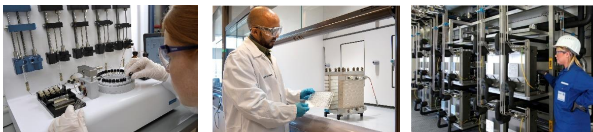
Figure 3. A range of reactor products suited for research, development and production under continuous flow conditions.